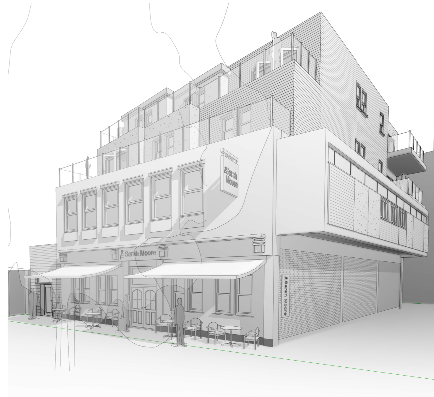
5 Street View 2