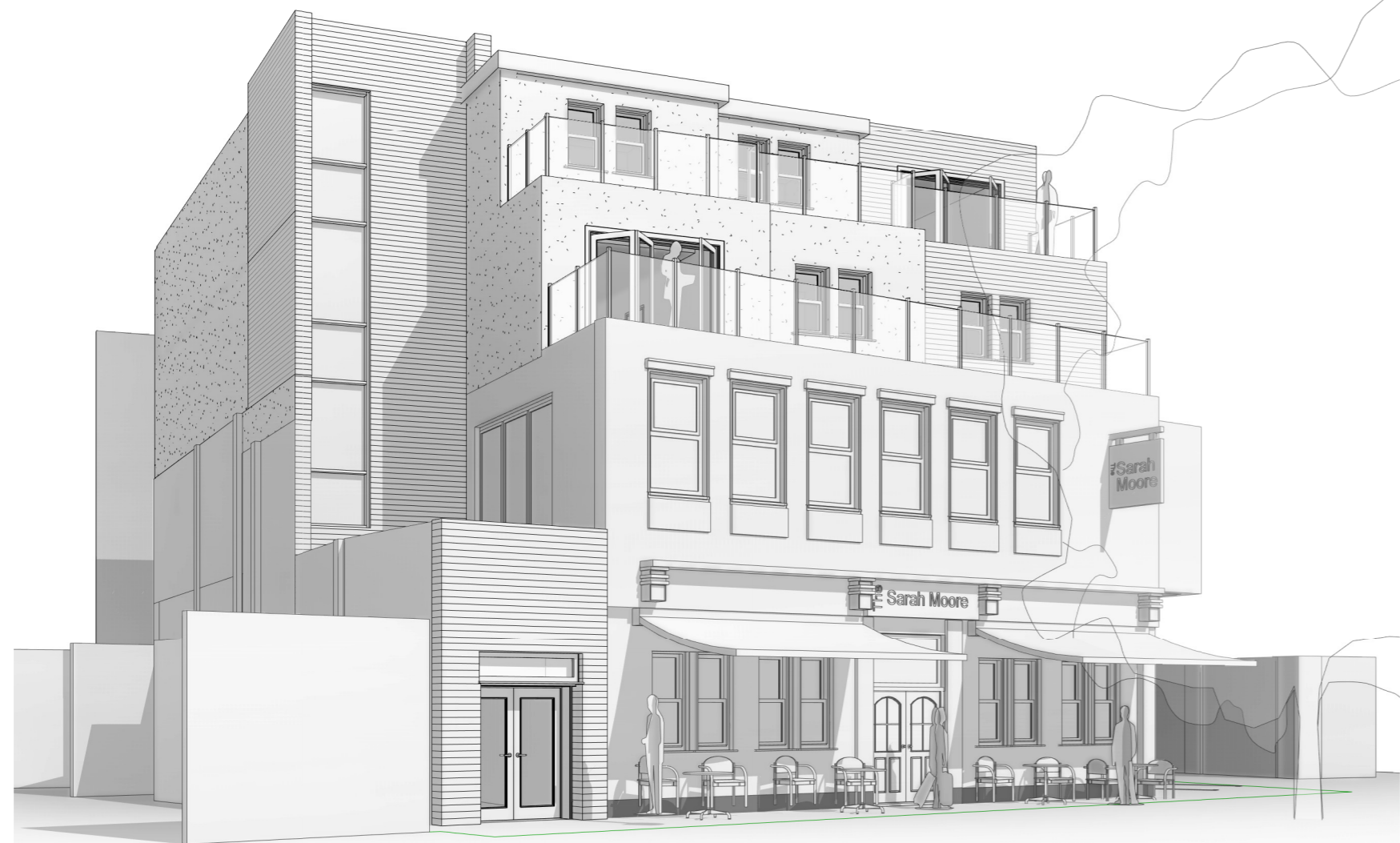
4 Street View 1